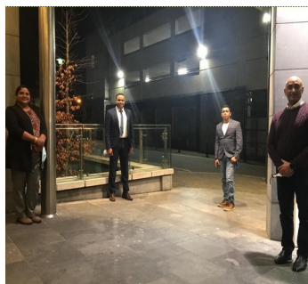
Ambassador with frontline healthcare workers in Kilkenny