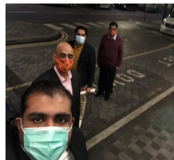
Ambassador with frontline healthcare workers in Wexford