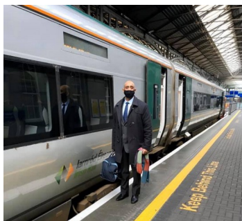
Essential trip to Limerick: Ambassador on Dublin Heuston train station (Irish rail)

7. Embassy Provincial Outreach Programme: During the month, in view of Covid-19 restrictions Level 5 (top most), Embassy was constrained to conduct majority of its activities through virtual modes. However, few essential provincial outreach visits, aimed at helping Indian community, assuring full support and expressing gratitude to front-line health-care workers for exceptional services were undertaken. Ambassador visited Limerick (11 Feb), Wexford (18 Feb) and Kilkenny (25 Feb) counties. During his visits, he was informed by local authorities that there has been significant recruitment of additional health care professionals across the country from India over the last year. In Limerick itself, 150+ new health workers have been deployed in medical institutions last year. During the visits, potential in economic areas such as medtech, health science and pharma was also identified.